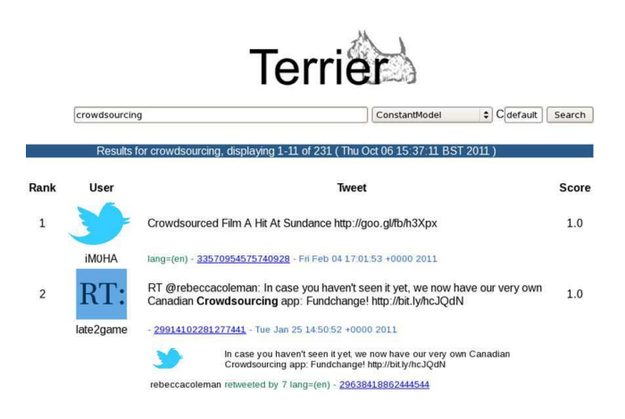
Figure 2: Terrier user interface for Twitter search.

eration that can be saved within a specialist meta index structure. This functionality can be paired with the Terrier front-end search interface to facilitate custom search applications, such as Twitter search, as illustrated in Figure 2.