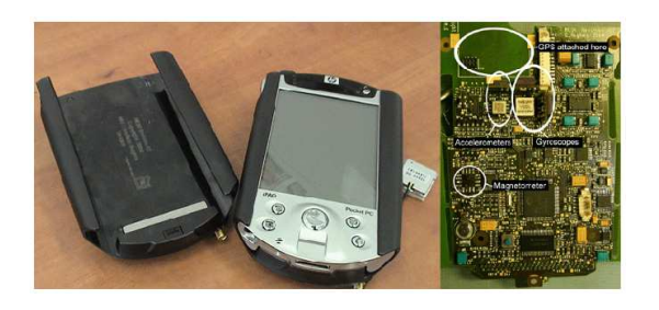
Figure 1. The MESH expansion pack, with an iPaq 5550 PocketPC. This provides accelerometer, gyroscope and magnetometer readings, as well as vibrotactile display.

Realistic synthesis of vibrotactile and audio sensations are key to building eyes-free interfaces. There has been a great deal of recent interest in physical models of contact sounds and associated vibration profiles. The model-driven approach is a fruitful design method for creating plausible and interpretable multimodal feedback without extensive ad hoc design. Yao and Hayward ([15]), for example, created a convincing sensation of a ball rolling down a hollow tube using an audio and vibrotactile display. A similar sonification of the physical motion of a ball along a beam is described in detail in [10]; subjects were able to percieve the motion ball from the sonification alone. A simple haptic "bouncing ball" on mobile devices was demonstrated by Linjama et al. [8], which used tap sensing to drive the motion of a ball; this, however did not incorporate realistic dynamics or auditory feedback. Granular approaches to realistic natural sound generation were explored in [9], where contact events sensed from a contact microphone above a bed of pebbles drove a sample-based granular synthesis engine. A wide variety