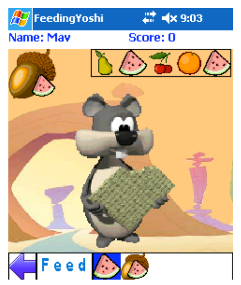
Figure 2. The Yoshi screen shows the Yoshi himself, as well as the five fruits he currently desires (top right) and a seed of his favourite fruit (top left). After selecting one or more of the fruit in the basket (bottom right), the Feed button is used to feed the Yoshi and gain points. The left arrow returns to the map.

On first being detected, a Yoshi or plantation appears in the centre of the currently displayed area of the map, although a player can 'pin' a Yoshi or plantation icon in a better place. On the right hand side of the map are buttons for switching to a list view rather than the map, panning, zooming and selecting a Yoshi to be highlighted on the map as a 'favourite'. Along the bottom of this screen, and also shown in the other two screens in the game, is the player's 'basket' that provides space for a limited number of fruits and seeds to be carried. Clicking on a Yoshi brings up a screen showing the Yoshi, a seed for his favourite fruit, and the five fruit he currently wishes to eat (Figure 2). Similarly, clicking on a plantation leads to another screen with either a tree empty of fruit, i.e. an unseeded plantation, or a tree with fruit ready to be picked, i.e. a seeded plantation. Seeding is done by selecting a seed in the basket then clicking a Seed button.