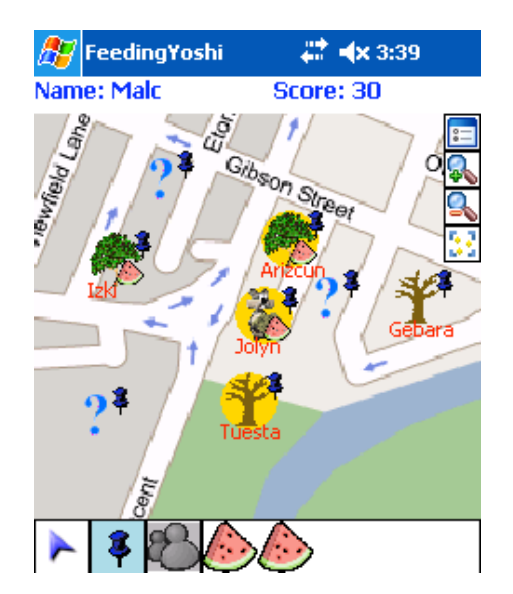
Figure 1. In the map screen, Yoshis and plantations are shown as icons, and navigation controls are on the right. Near the bottom is a row containing (from left to right) a button for selecting icons, pinning an icon onto the map, initiating a swap with another player (greyed out), and the basket of up to five fruit: in this case two melons.

Feeding Yoshi is a mobile multiplayer game that is played over a relatively long period—the game we report on here lasted a week. Rather than being built on the assumption of users' continuous engagement over such a long time, we assume that players use the system intermittently, as they go through their normal daily routines of work and leisure.