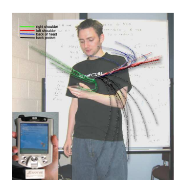
Fig. 1. Example of the drift encountered when acceleration traces are integrated into positions. Significant integration drift is observed, leading to end-point uncertainty.

The Dynamic Movement Primitives (DMP) algorithm proposed by Schaal et al., is "a formulation of movement primitives with autonomous non-linear differential equations whose time evolution creates smooth kinematic control policies" [5,6]. The idea was developed for imitation-based learning in robotics, and is a natural candidate for application to gesture recognition in mobile devices. It allows us to model each gesture trajectory as the unfolding of a dynamic system, and is better able to account for the normal variability of such gestures. Importantly, the primitives approach models from origin to goal as opposed to the traditional point-to-point gestures used in other systems. This, along with the compact and very well-suited model structure enables us to train a system with very few examples, with a minimal amount of user training and also provides us with the opportunity to add richer feedback mechanisms to the interaction during the gesture.