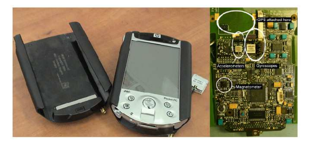
Figure 1: The MESH expansion pack, with an iPaq 5550 PocketPC. This provides accelerometer, gyroscope and magnetometer readings, as well as vibrotactile display.

signals; the dynamics model, to simulate the motion of the virtual objects; and the display, which reveals the state of those objects.