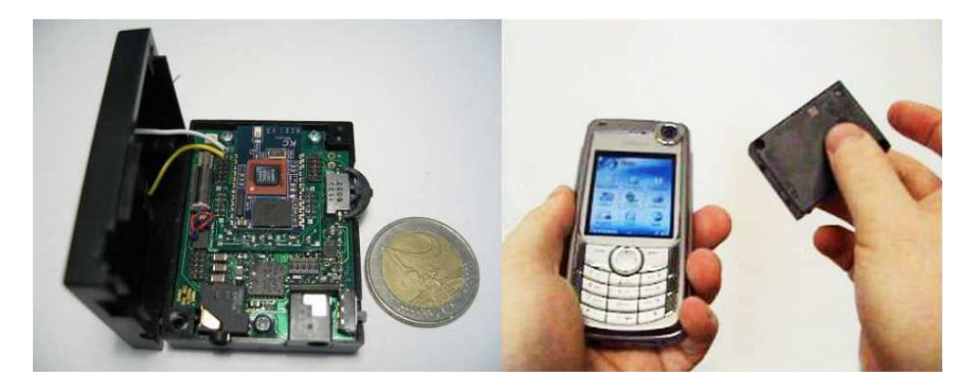
Figure 2: The wireless SHAKE sensor, shown with a 2 Euro piece for size comparison. This Bluetooth device comprises a complete inertial sensing platform.