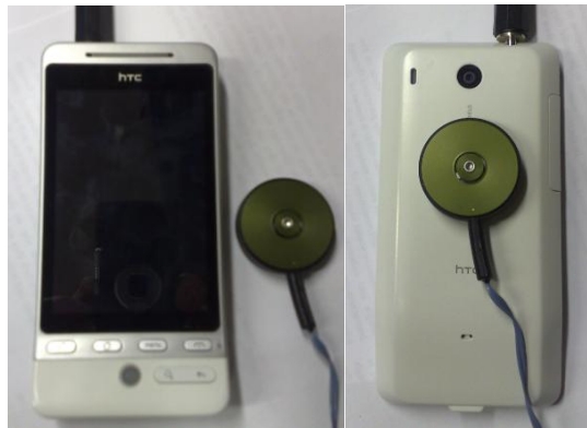
Figure 2. The equipment used. The HTC Hero phone with an EAI C2 Tactor vibrotactile device attached to the back, connected via the headphone socket.

old, the audio stream is unpaused. The rate and volume of playback are altered depending of the rate of movement of the user. To present the texture to a user, we use an EAI C2 Tactor ( www.eaiinfo.com ) attached to the back of an HTC Hero mobile phone and connected via the headphone socket (as shown in Figure 2). The C2 is a small, high quality linear vibrotactile actuator, which was designed specifically to provide a lightweight equivalent to large laboratory-based linear actuators. The contactor in the C2 is the moving mass itself, which is mounted above the housing and pre-loaded against the skin. This is a higher performance device than the vibration motors commonly found in mobile phones and allows us to explore richer textures in this early phase of our work and to find the key aspects to differentiate textures. We will eventually use an inbuilt actuator.