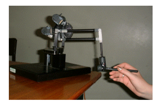
Fig 1: The Phantom 3D force feedback device from SensAble Technologies.

The interaction relies on kinesthetic information being conveyed to the user rather than cutaneous information (see table 1).