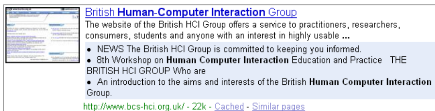
Fig. 1. Search result with TRS and thumbnail (Layout 4)

Layout 4: Baseline + TRS + Thumbnail - The last layout was the combination of Layout 2 and 3 (See Fig. 1). While this layout took up the largest space in the screen, it was designed to provide the largest amount of information per record among the four layouts.