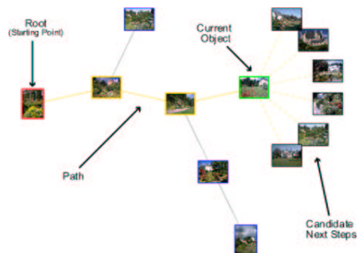
Fig. 1. The ostensive path

The Ostensive Model (OM) of developing information needs was initially proposed by Campbell and van Rijsbergen [4]. It combines the two complementary approaches to information seeking: query-based and browse-based. It supports a query-less interface, in which the user’s indication of the relevance of an object—through pointing at an object—is interpreted as evidence for it being relevant to his current information need. Therefore, it allows direct searching without the need of formally describing the information need.