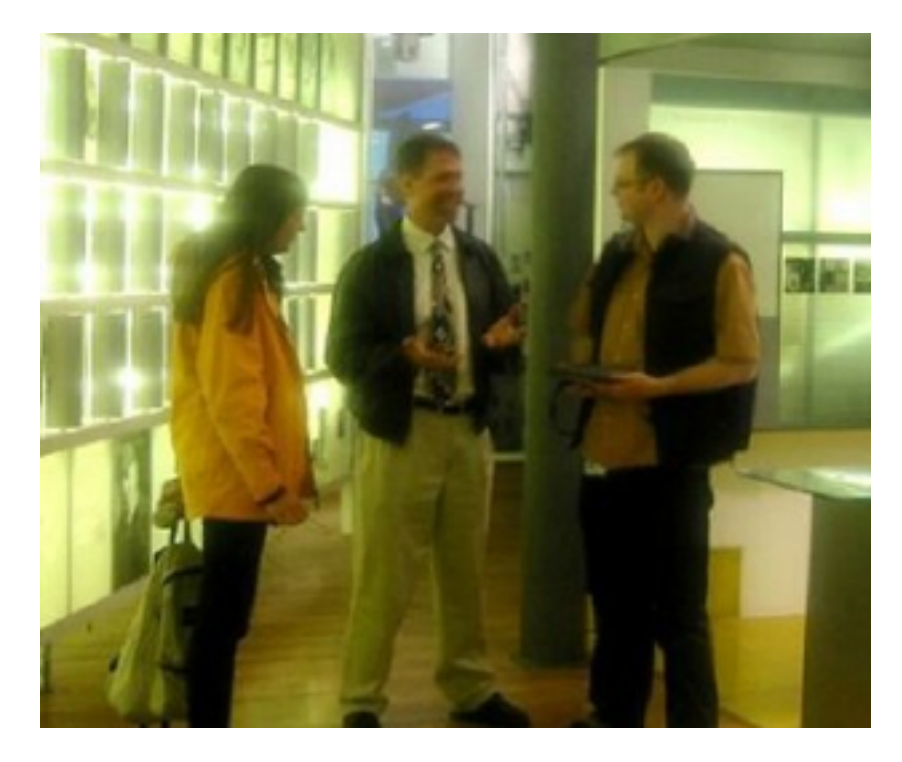
Fig. 2. Three physical visitors with Vee (right) wearing Bristol CyberJacket.

Vee uses a Jornada 568 that polls position and orientation sensors, and sends the results to a proxy for the City EQUIP data space, using a custom protocol over a TCP socket. The protocol also supports sending of visitor information to the Jornada from the proxy. The proxy is responsible for inserting Vee's information into the data space, and retrieving the information for the other visitors. If necessary, the proxy transforms Vee's spatial reference frame to that of the spatial model in the data space—for example Vee's magnetic compass orientation (clockwise) is transformed to Cartesian orientation (anti-clockwise). The positions and orientations of all visitors are presented to Vee on a 2-dimensional map. Figure 2 shows three physical visitors with Vee (on the right) wearing a University of Bristol CyberJacket (with a Jornada 690 rather than a Jornada 568). The figure also gives some sense of the visual richness of the physical information in the Centre.