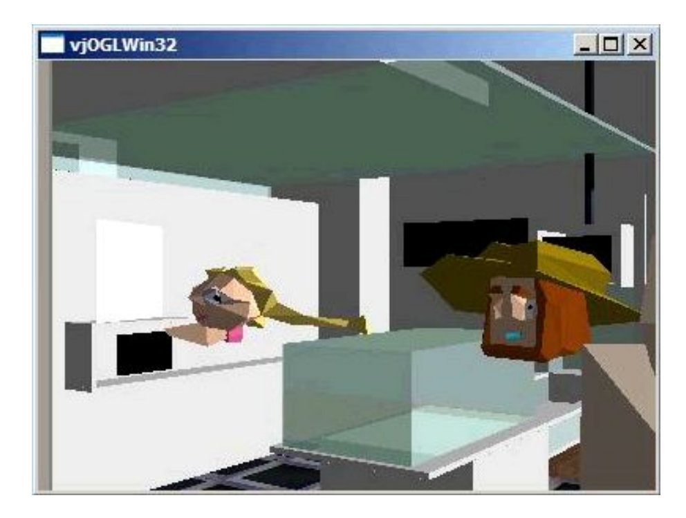
Fig. 1. 3-D rendering presented to Ana showing avatars for Vee (left) and Dub.

In the remainder of this section we detail how we support spatial and informational awareness for synchronous sharing of visiting experiences, and how we are implementing annotation and recommendation systems for asynchronous sharing of visiting experiences. Audio support for synchronous visiting is handled by a discrete subsystem that we will not detail in this paper.