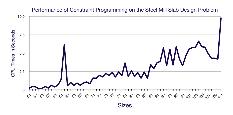
Fig. 3. Performance of the COMET Program with no Global Constraint