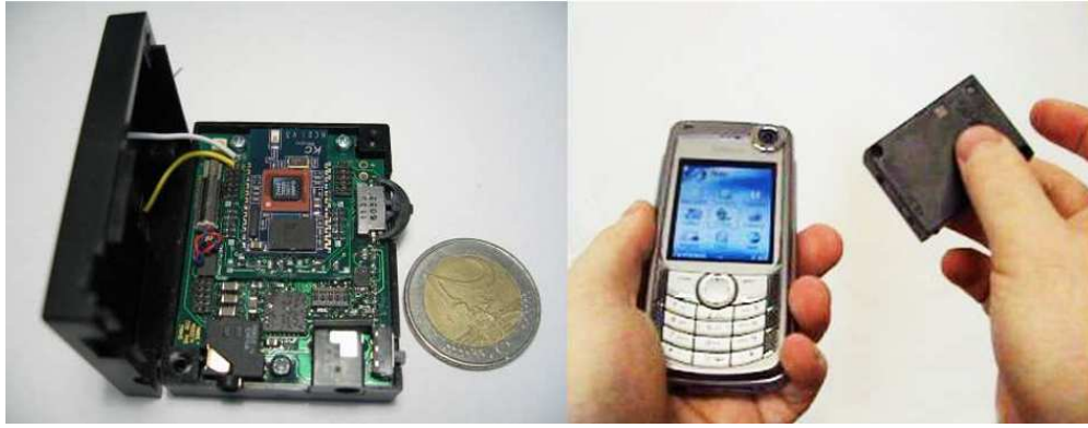
Figure 2: The wireless SHAKE sensor, shown with a 2 Euro piece for size comparison. This Bluetooth device comprises a complete inertial sensing platform.