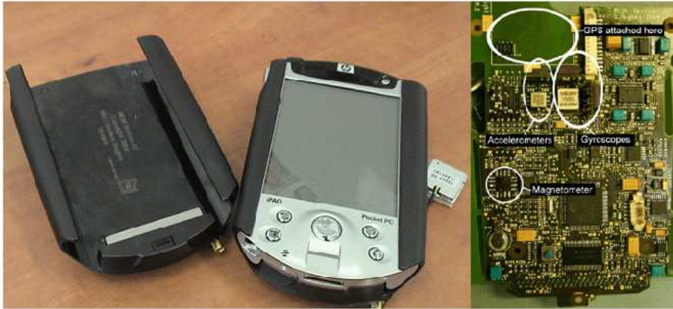
Figure 1: The MESH expansion pack, with an iPaq 5550 PocketPC. This provides accelerometer, gyroscope and magnetometer readings, as well as vibrotactile display.

signals; the dynamics model, to simulate the motion of the virtual objects; and the display, which reveals the state of those objects.