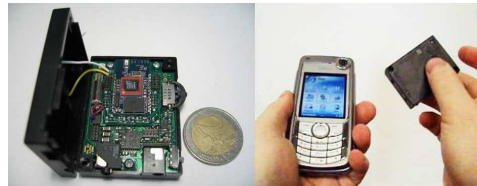
Figure 2. The wireless SHAKE sensor, shown with a 2 Euro piece for size comparison. This Bluetooth device comprises a complete inertial sensing platform.

which used tap sensing to drive the motion of a ball; this, however did not incorporate realistic dynamics or auditory feedback. Granular approaches to realistic natural sound generation were explored in [9], where contact events sensed from a contact microphone above a bed of pebbles drove a sample-based granular synthesis engine. A wide variety of sonorities could be generated as a result of physical interactions with the pebbles. This granular approach is used as the synthesis engine in the Shoogle prototypes. Complete working prototypes of Shoogle have been implemented on both PDA and standard mobile phone platforms. There are three important components of Shoogle: the sensing hardware, to transform motion into measurable signals; the dynamics model, to simulate the motion of the virtual objects; and the display, which reveals the state of those objects.