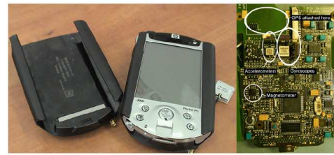
Figure 1. The MESH expansion pack, with an iPaq 5550 PocketPC. This provides accelerometer, gyroscope and magnetometer readings, as well as vibrotactile display.

Realistic synthesis of vibrotactile and audio sensations are key to building eyes-free interfaces. There has been a great deal of recent interest in physical models of contact sounds and associated vibration profiles. The model-driven approach is a fruitful design method for creating plausible and interpretable multimodal feedback without extensive ad hoc design. Yao and Hayward ([15]), for example, created a convincing sensation of a ball rolling down a hollow tube using an audio and vibrotactile display. A similar sonification of the physical motion of a ball along a beam is described in detail in [10]; subjects were able to perceive the motion ball from the sonification alone. A simple haptic “bouncing ball” on mobile devices was demonstrated by Linjama et al. [8],