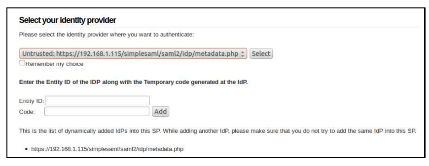
Fig. 2. Added IdP at the WAYF.

13. Once the user is logged in, the Consent module is called internally. It reads the semitrusted.sp configuration parameter and displays the attributes automatically. Figure 3 shows the consent form. The consent page also states which attributes are filtered out from the full set and why. At this point, the user can choose which attributes she wants to release to the SP.