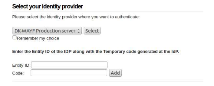
Fig. 1. Additional Text Fields at the WAYF.