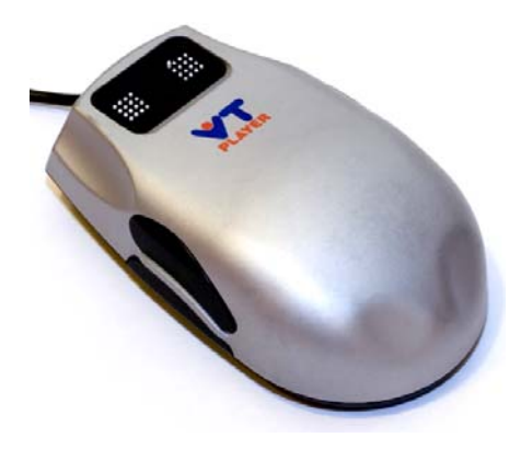
Figure 4. The VTPlayer tactile mouse. A commercially available virtual tactile display with two arrays of 4 by 4 pins from VirTouch (www.virtouch2.com).

tain workspace and the tactile display to be updated accordingly, dependant on where the user is on a "virtual image". They can be distinguished from devices such as the Optacon in that they are most commonly employed to represent information that is stored digitally on a computer, rather than present in the user's distal environment. Active exploration is necessary to perceive the entirety of the image being displayed.