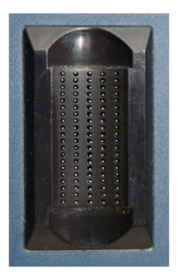
Figure 3. Using the Optacon device to read text. The image on the right shows a close-up of the pin array.

Early pioneering work in tactile vision substitution (TVSS) was also performed by Bach-y-Rita and colleagues in the late 1960s. Early systems displayed visual information captured by a tripod mounted TV camera to a vibrotactile display on the user's back. Due to limited spatial resolution, tactile masking effects and a low dynamic range, the system was not suitable for day-to-day navigation. However, subjects could easily recognize simple shapes and discriminate orientation of lines. It was also reported that experienced users could perform more complex tasks, such as recognition of faces, or electronic assembly using the system (Kaczmarek and Bach-y-rita, 1995).