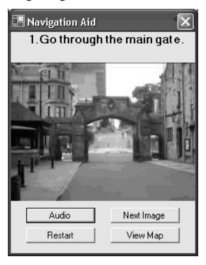
Figure 1. An example screen from the navigation aid.

Based on results from the focus groups, we designed a prototype aid, running on a Compaq iPAQ, that describes routes using landmarks, presented via photographs, text and speech. A sample screen from the device is shown in Figure 1. It displays a photograph of a landmark that can be seen from the start of the route. Once the user reaches the landmark, he or she presses the button labelled "Next Image" to progress to the next instruction, describing a new location to head towards. A brief text description is shown above the photograph and a longer speech instruction can be heard when the "Audio" button is pressed. For example, the instruction for the screen in Figure 1 is "Directly ahead of you, you will see the University Main Gate. Please go through it." The "View Map" button shows a simplified map of the route and "Restart" returns the user to first screen at the beginning of the route.