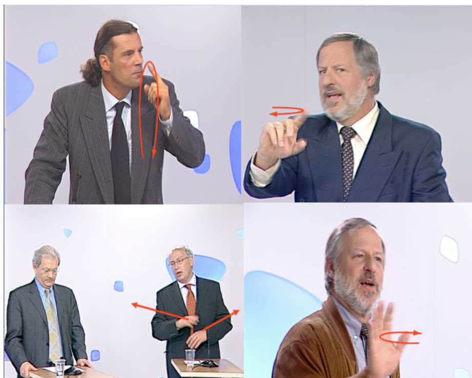
Fig. 3: Behavioural cues typical of disagreement (clockwise from top left): forefinger raise, forefinger wag, hand wag, and hands scissor (Bousmalis et al., 2009). These cues can be recognize with state-of-the-art human-action-recognition techniques like that proposed by Oikonomopoulos et al (2010).

recognition have been recently proposed (Gunes & Pantic, 2011; Nicolaou et al., 2011; Eyben et al., 2011; see also Gunes & Pantic, 2010, for a survey of the past work in the field), a number of crucial issues need to be addressed first if these approaches to automatic dimensional and continuous emotion recognition are to be used with freely moving subjects in real-world scenarios like patient-doctor discussions, talk-shows, job interviews, etc. In particular, published techniques revolve around the emotional expressions of a single subject rather than around the dynamics of the emotional feedback exchange between two subjects, which is the crux in the analysis of any social emotions. Moreover, the state of the art techniques are still unable to handle natural scenarios such as incomplete information due to occlusions, large and sudden changes in head pose, and other temporal dynamics typical of natural facial expressions (Zeng et al. 2009), which must be expected in human-human interaction scenarios in which social emotions occur.