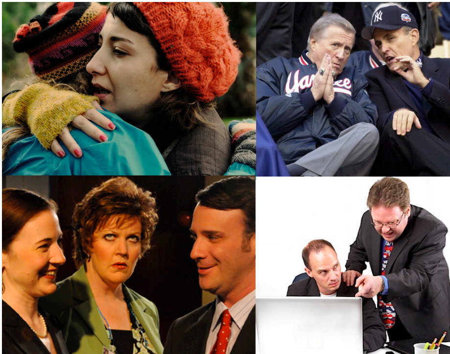
Fig. 2: “Social Facts” (from top left, counter clock wise): social emotions (compassion and empathy), social attitudes (approval and disapproval), social relations (dominance), and social relations (confederates).

Social emotions : A clear distinction can be made between individual and social