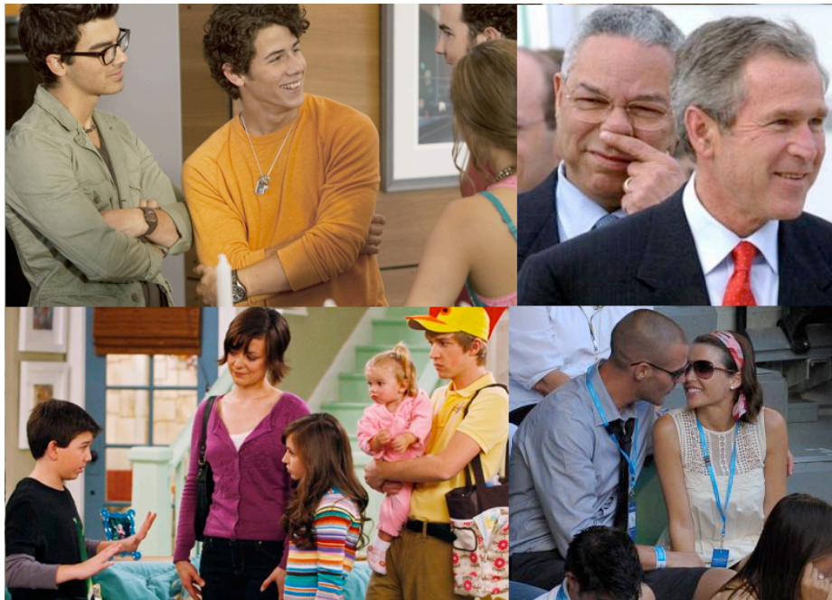
Fig. 1: Manifestations of social signals include a variety of non-verbal behavioural cues including facial expressions, body postures/ gestures, vocal outbursts like laughter, etc.

Social Signal Processing (SSP) (Pentland, 2005, 2007; Vinciarelli et al. 2008,