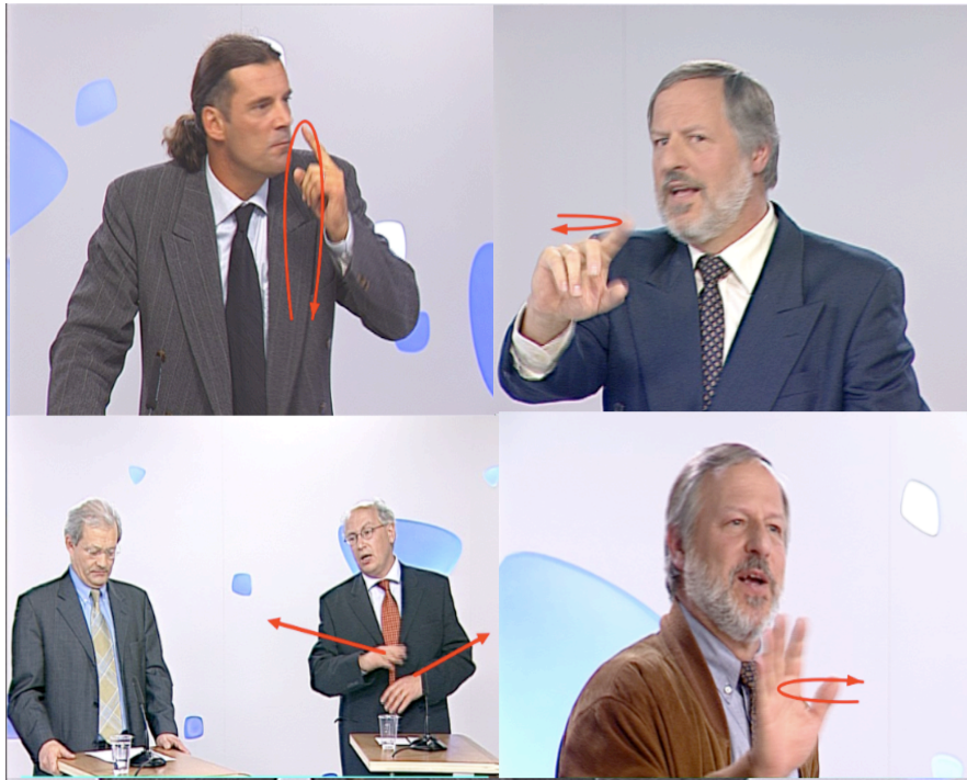
Fig. 3: Behavioural cues typical of disagreement (clockwise from top left): forefinger raise, forefinger wag, hand wag, and hands scissor (Bousmalis et al., 2009). The cues can be recognize with state-of-the-art human-action-recognition techniques like that proposed by Oikonomopoulos et al (2010).

Fusion: How to model temporal multimodal fusion which will take into account temporal correlations within and between different modalities? What is the optimal level of integrating these different streams? Does this depend upon the time scale at which the fusion is achieved? What is the optimal function for the integration? More specifically, most of the present audiovisual and multimodal systems in the field perform decision-level data fusion (i.e., classifier fusion) in which the input coming from each modality is modelled independently and these single-modal recognition results are combined at the end. Since humans display audio and visual expressions in a complementary and redundant manner, the assumption of conditional independence between audio and visual data streams in decision-level fusion is incorrect and results in the loss of information of mutual correlation between the two modalities. To address this problem, a number of model-level fusion methods were proposed that make use of the correlation between audio and visual data streams, and relax the requirement of synchronization of these streams (Zeng et al., 2009). However, how to model multimodal fusion on multiple time scales and how to model temporal correlations within and between different modalities is yet to be explored.