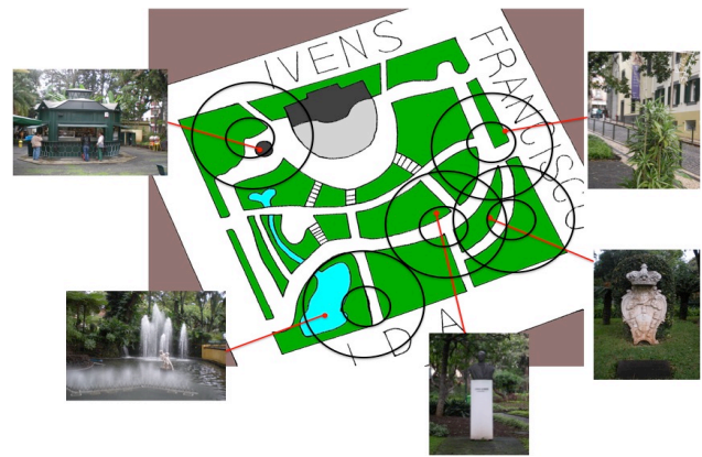
Figure 1. Municipal Gardens in Funchal, Madeira. Still images of the landmarks and illustration of proximity and activation zone per landmark.

A sound garden [1] is a virtual audio environment composed of a set of precisely situated sounds spatially overlaid on an urban park. Using GPS or WIFI technology, the position of users in relation to specific audio landmarks is tracked and information related to their proximity to these landmarks is presented. A sound garden is usually intended for users to casually explore and experience rather than navigate via predefined paths. The unstructured nature of this activity presents unique challenges for the design of audio feedback to support exploration. Fundamentally, individual landmarks need to advertise themselves both to attract the user’s attention and support subsequent targeting. This is typically achieved using an acoustic beacon– sounds which activate when a user is within a specific distance from a landmark [2]. Two concentric levels of beaconing feedback are beneficial, the first in a wide proximity zone and the second in a narrower activation zone. The goal of audio cues in the proximity zone is to provide unobtrusive audio guidance, which enables a user to move towards the activation zone. Once this inner zone is successfully reached, additional content is made available to the user, either to indicate that a landmark has been found or to provide structured information describing it. Beyond other design considerations, the size of these zones is influenced by the accuracy of the tracking technology: larger errors (e.g. conventional GPS) require larger zones for