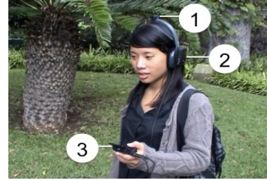
Figure 2. Experimental setup. 1) JAKE sensor, 2) GPS receiver, and 3) mobile device.

Eight users (6 male, 2 female, all right-handed) participated in a