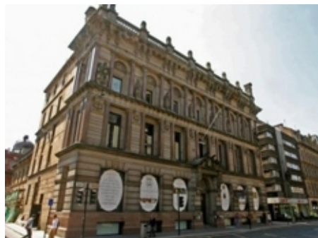
The Corinthian Club

If you need to call for a taxi at any point, the number for Glasgow Taxis is 0141 429 7070.