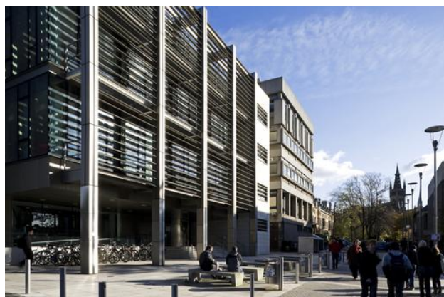
Sir Alwyn Williams Building

Once you leave the main gate of the University, cross University Avenue at the pedestrian crossing and turn left. Take the first right onto University Gardens. Follow the street to the end past the Queen Margaret Union and descend the steps. Keep going along the pedestrian concourse and the Sir Alwyn Williams Building is on your right. Enter via the revolving doors or press the pad beside the disabled entrance. Take the stairs or lift to Level 5 where the lunch will be served.