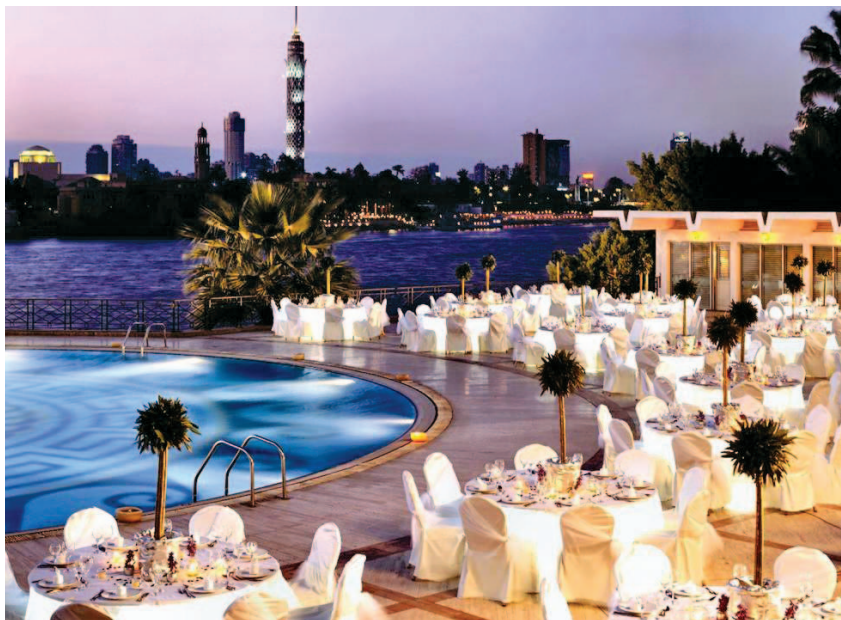
A view of Cairo from the hotel (image courtesy of the Grand Hyatt, Cairo).

and organize transportation to the hotel. I advise you to get in touch with them through the ICIP 2009 Web site, http://www.icip2009.org/ . They can also